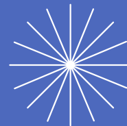
AEROSPACE, MARINE & DEFENCE SOLUTIONS